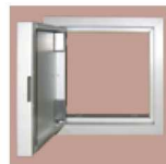
WALL AND CEILING ACCESS