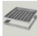
FLOOR ACCESS COVERS

To arrange a CPD Seminar at your premises please call: