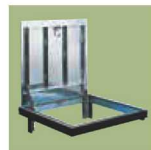
FLOOR ACCESS DOORS