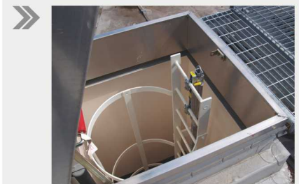
ROOF ACCESS HATCHES