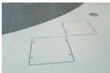
The floor finish for the 7500 Series can be matched to the location of the access cover

Howe Green has supplied many hospitals over the last 35 years including Southmead Hospital in Bristol and Queen's Hospital in Romford.