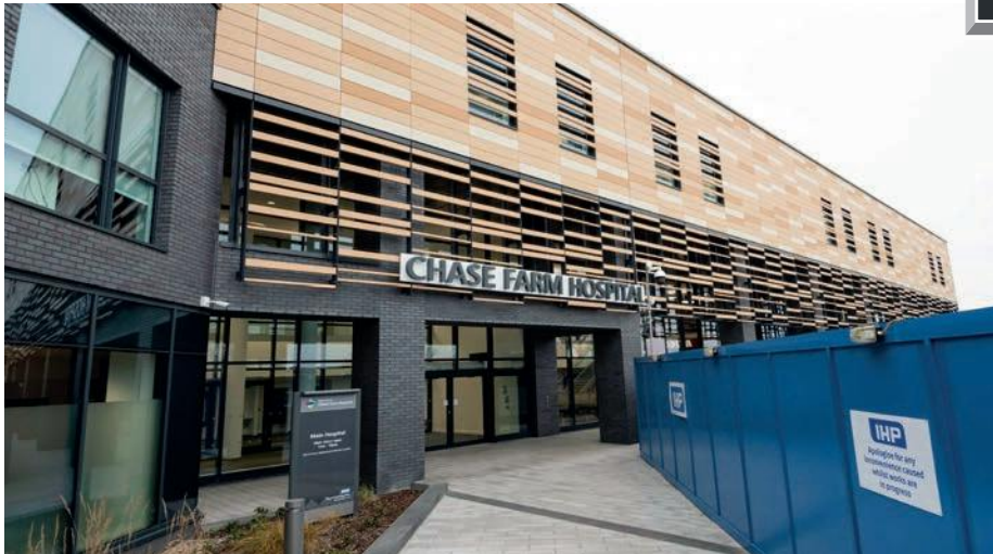
Chase Farm Hospital Enfield, the newest and most digitally advanced hospital in the NHS estate