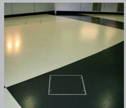
Visedge® covers are ideal for a busy hospital where the highest standards of hygiene and security are required

Howe Green Ltd. Marsh Lane, Ware Hertfordshire SG12 9QQ Tel: 01920 463230 Email: info@howegreen.co.uk www.howegreen.com