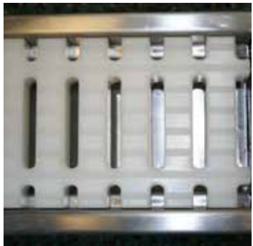
HG100 polymer grating cover