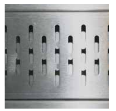
HG100 shower grating cover