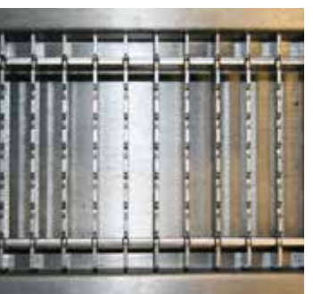
HG100 anti-slip ladder grating cover