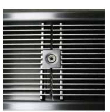
HG100 fine-linear grating cover